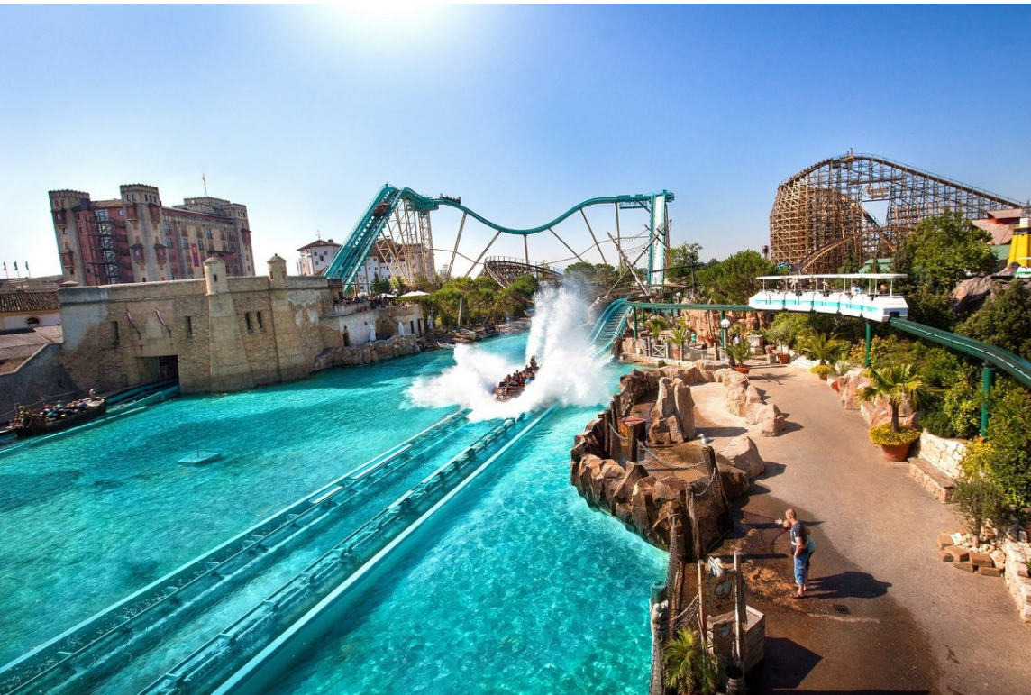
The summer season promises action, fun and relaxation