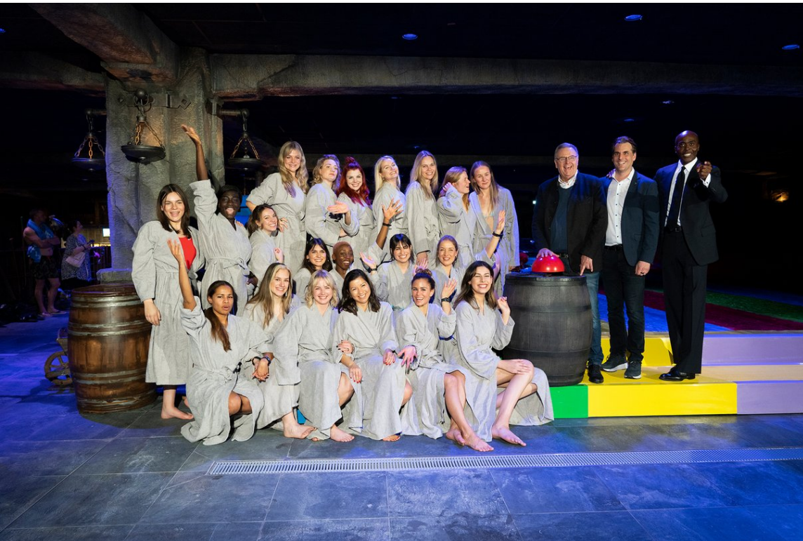
Bruce Darnell officially opens 'Vikingsløp' alongside the candidates of this year's Miss Germany election.