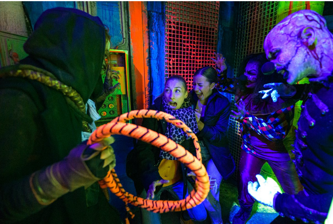
Sinister creatures provide nightmares at Traumatica - Festival of Fear

The award-winning horror spectacle in Rust near Freiburg