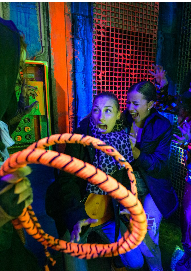
Sinister creatures provide nightmares at Traumatica - Festival of Fear

Admission is from 6:45pm, the start is at 7:00pm.