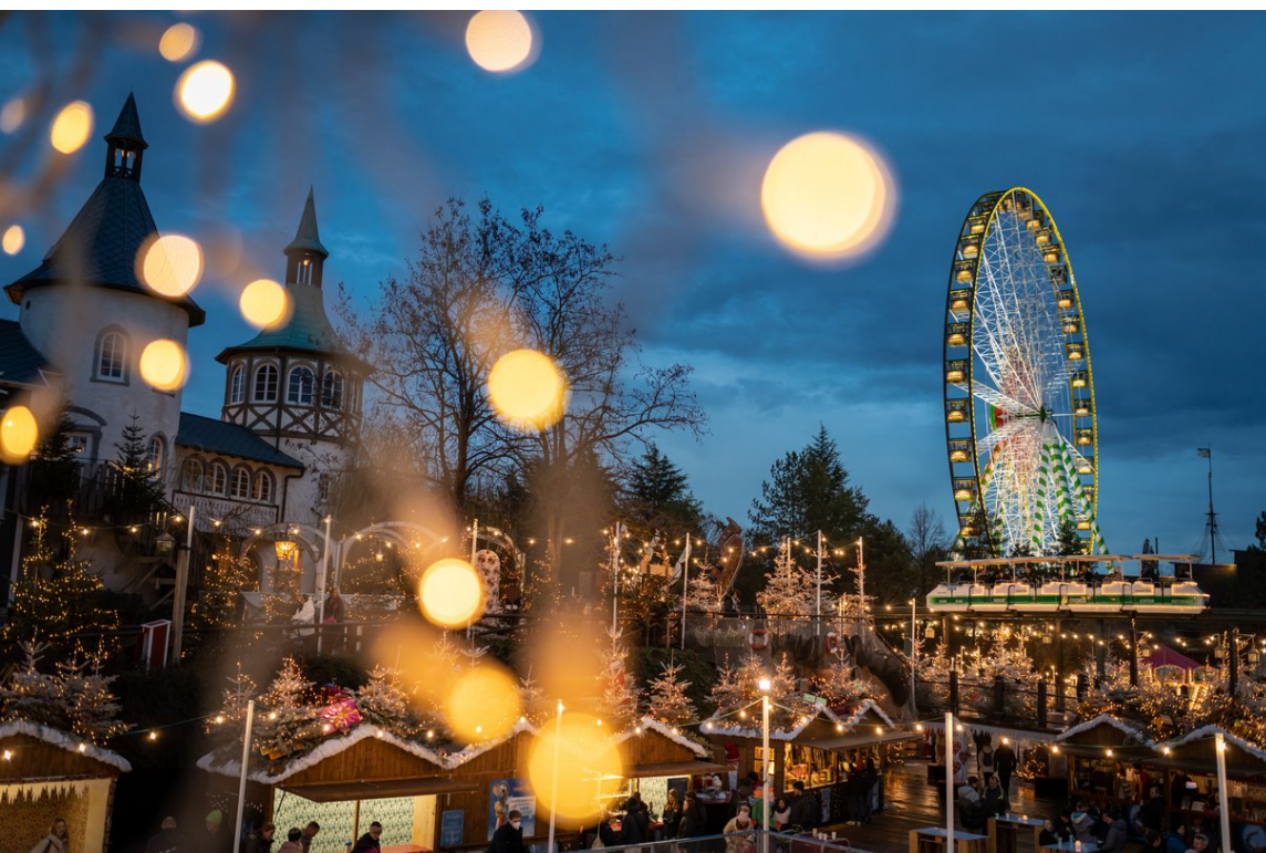
Europa-Park turns into a winter wonderland