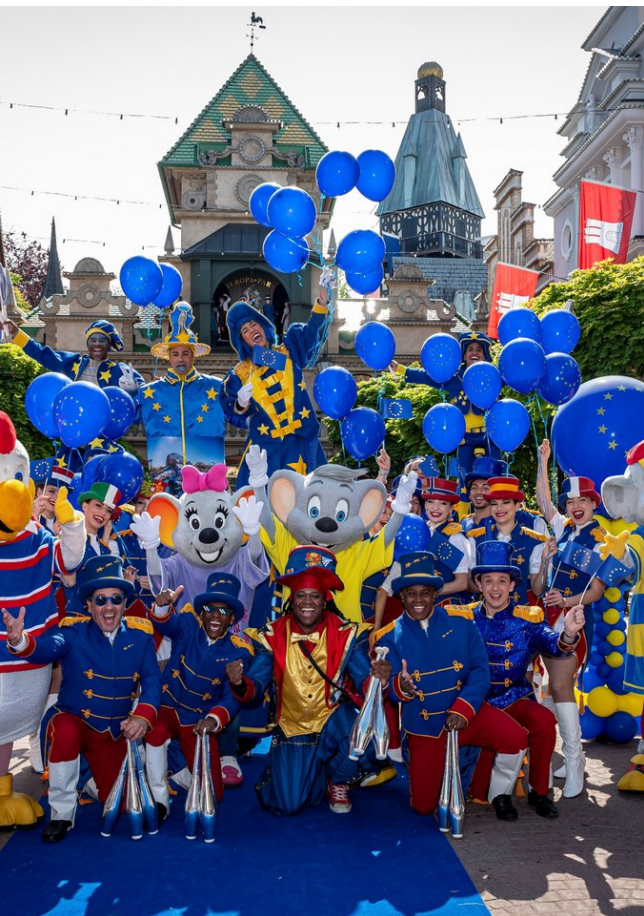
With different theme days, Europa-Park is celebrating the European idea