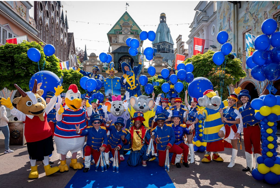
With different theme days, Europa-Park is celebrating the European idea