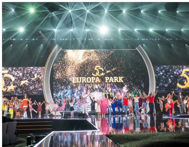
A fascinating journey through 50 years of Europa-Park history