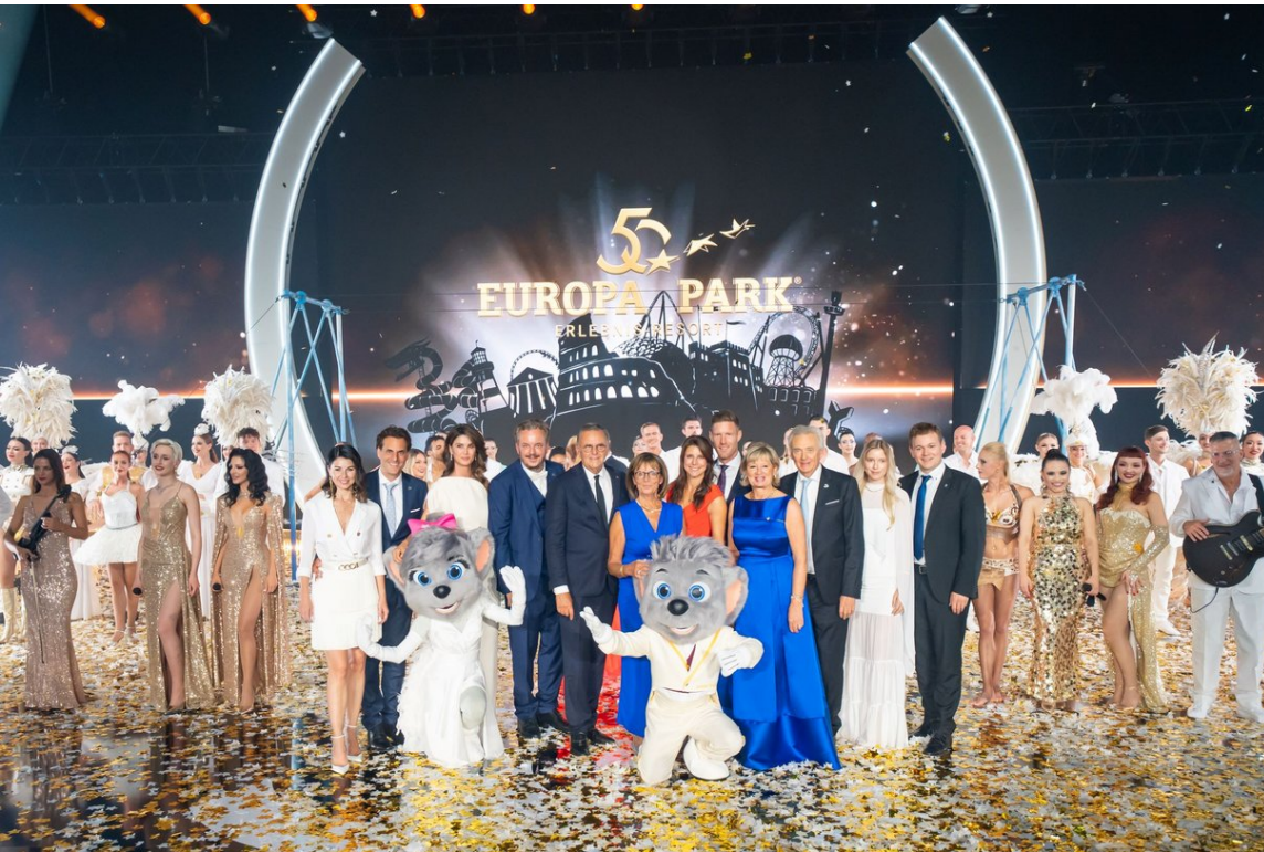
The Mack family at the gala evening