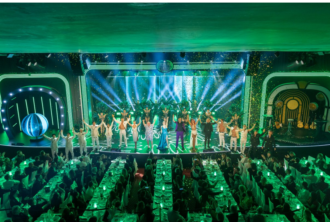
Dinner Show at Europa-Park

Fantastic performers and culinary delights