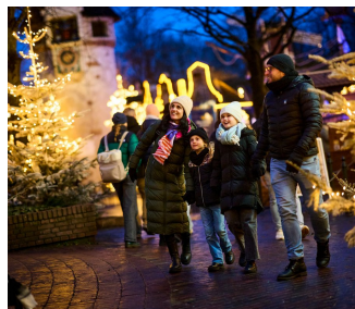
Until 18 January 2026, there will be a very special atmosphere at Europa-Park Resort