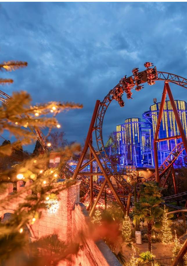
Europa-Park offers pure driving pleasure even in the winter season