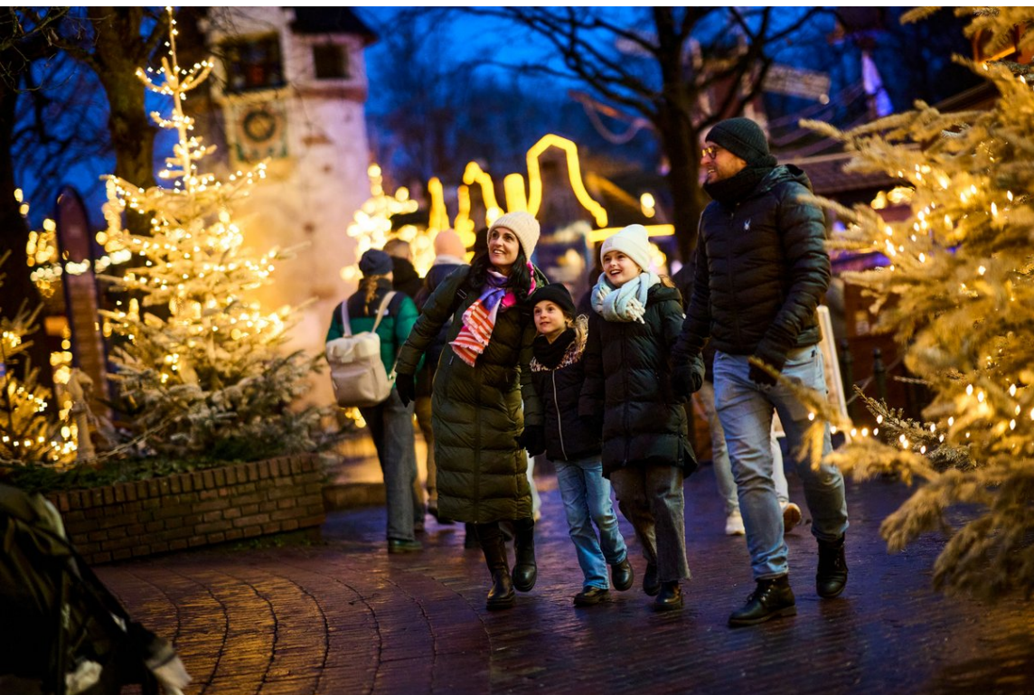
[Translate to English:] Wintersaison im Europa-Park