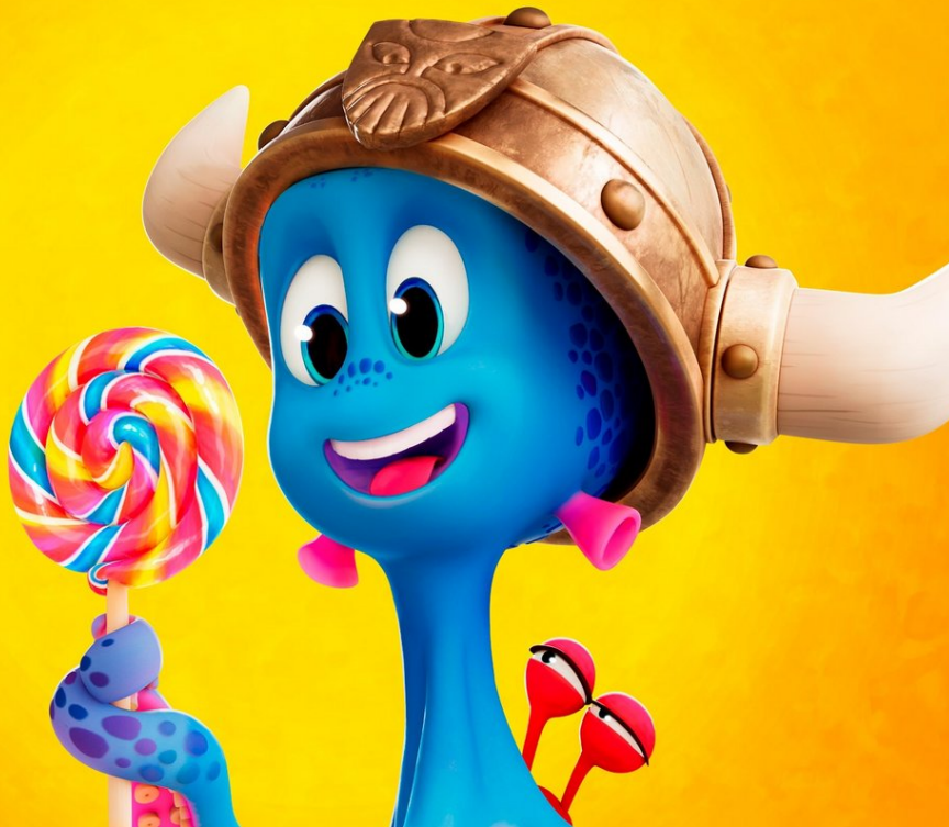
'SNORRI 4D' is set to launch at the 4D Magic Cinema at the start of the 2026 season