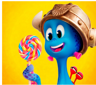
'SNORRI 4D' is set to launch at the 4D Magic Cinema at the start of the 2026 season